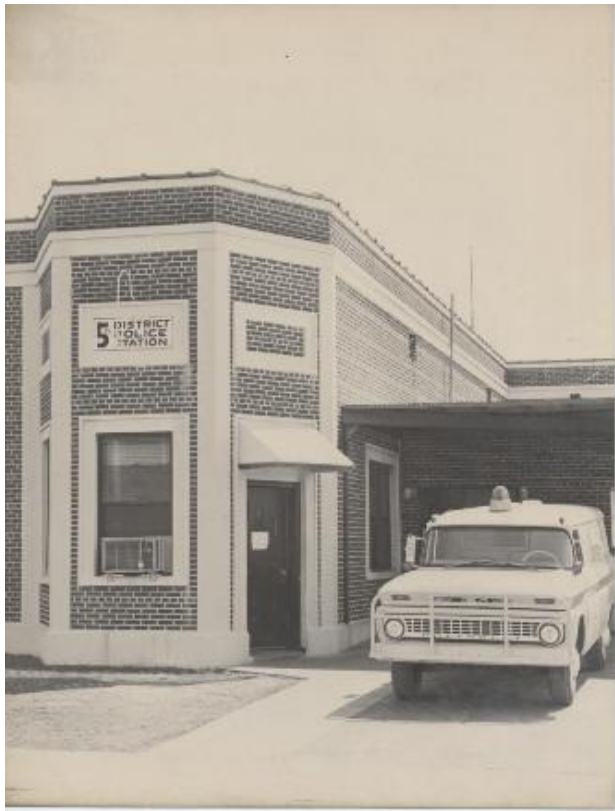
Fifth District Police Station 1964